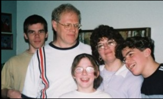
My family—about 1999